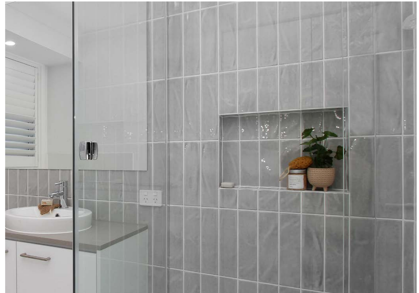
Shower Niche to Ensuite and Main Bathroom