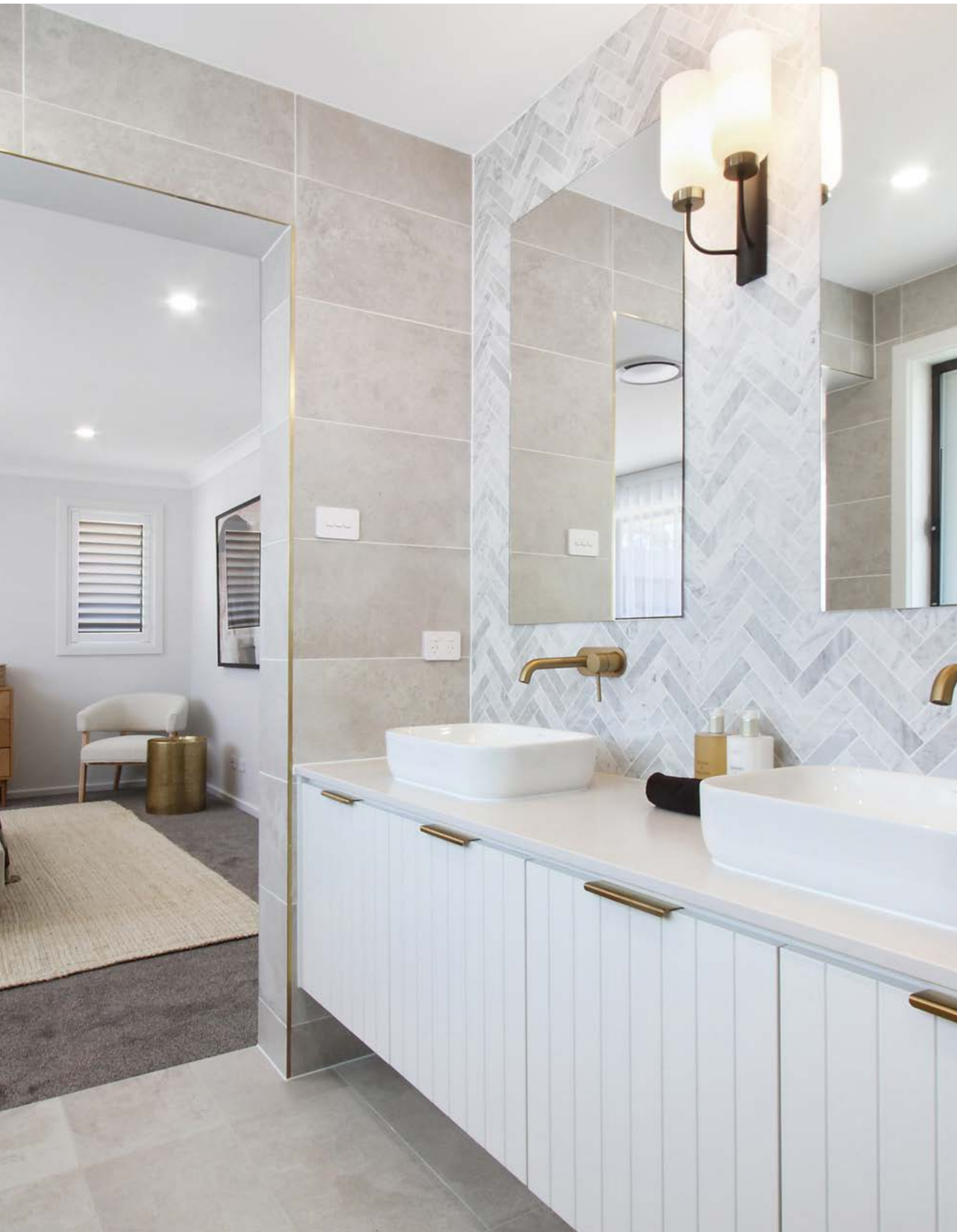
20mm Stone Benchtop and Soft close doors