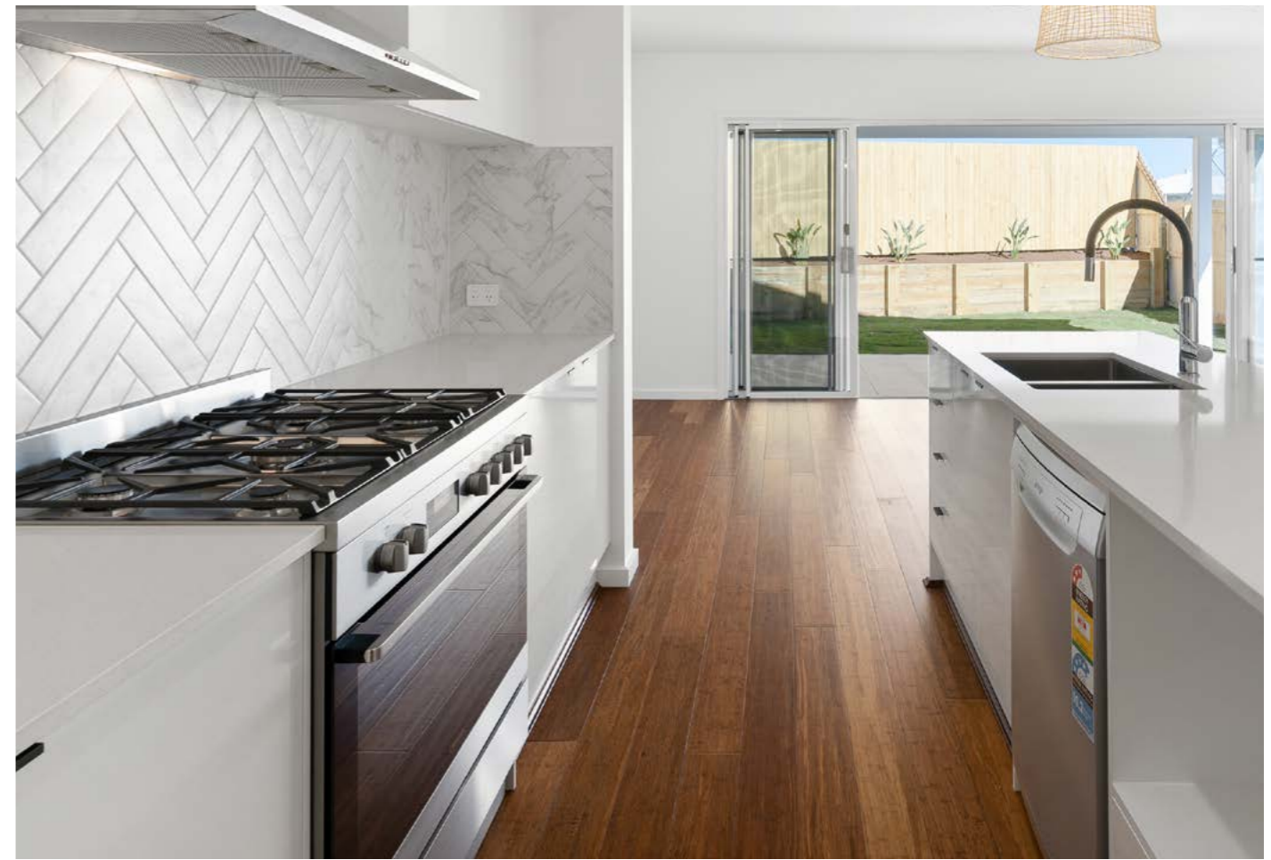
Westinghouse 900mm Freestanding Cooker WFE915SD